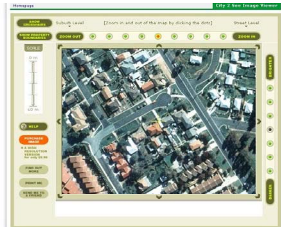
Sample: See your aerial photograph before you buy.